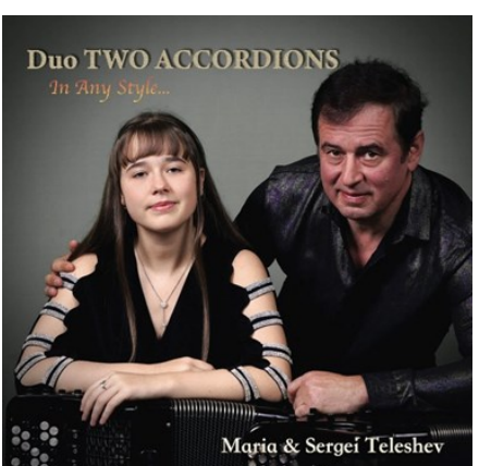
"Duo TWO ACCORDIONS" new CD, "In Any Style..."

Watch their CD promo video at: https://youtu.be/gq3GANov8H4. To order this exciting new CD or digitally download