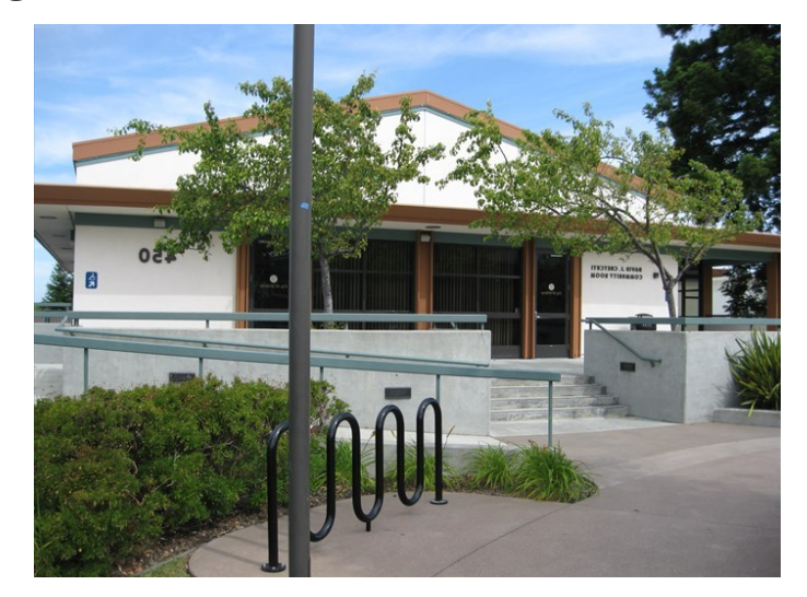
Chetcuti Community Room 450 Poplar Avenue, Millbrae Plenty of free parking in Library lot Accessible location Close to public transit (<1 mile from BART)

Come join us for fun and great music! Sunday, May 22 at 2:00 pm Chetcuti doors open at 2:00 PM, performance begins approximately 2:30 PM See email for link to online streaming See email for details, or contact info@sfaccordionclub.com