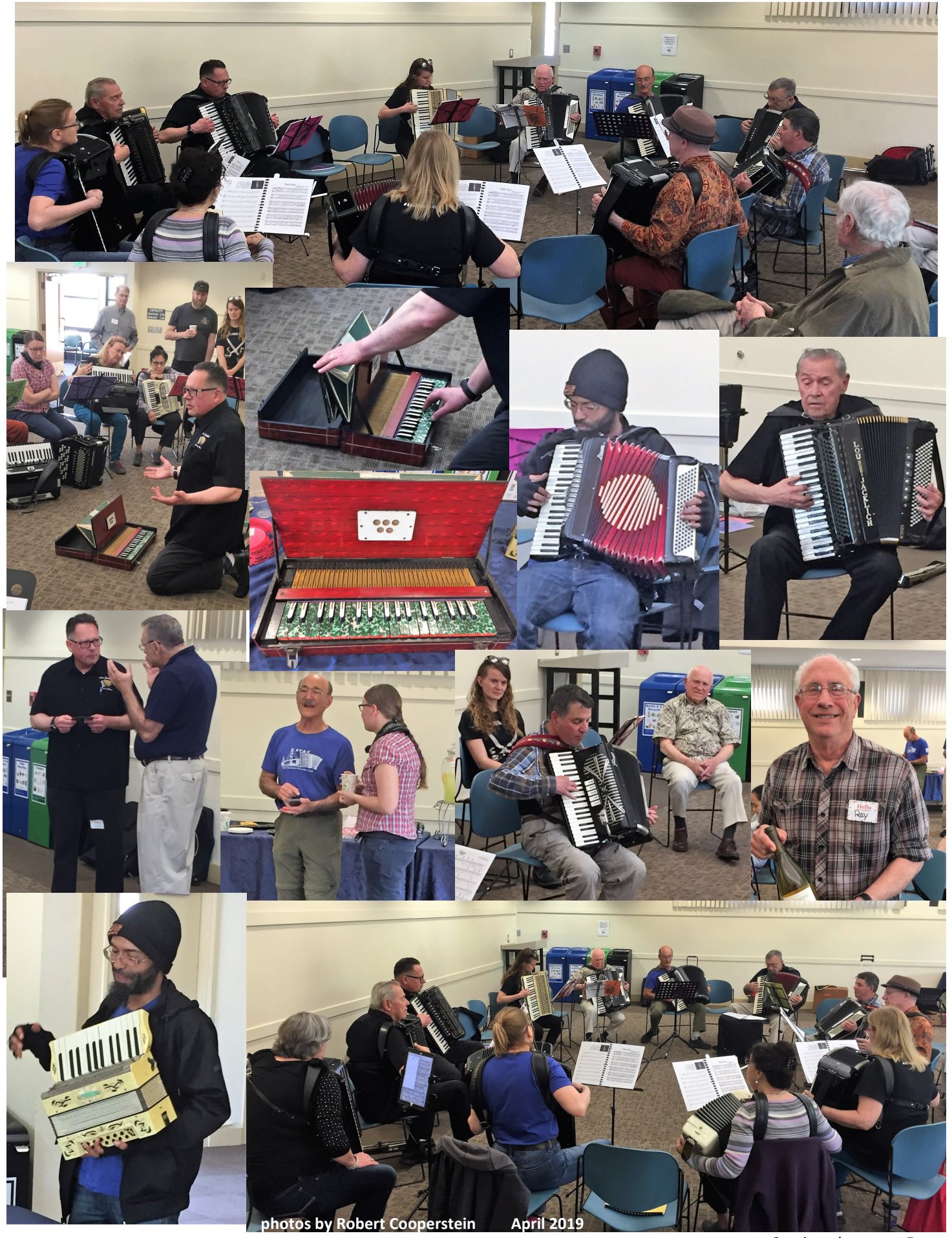
Continued on page 5 ...