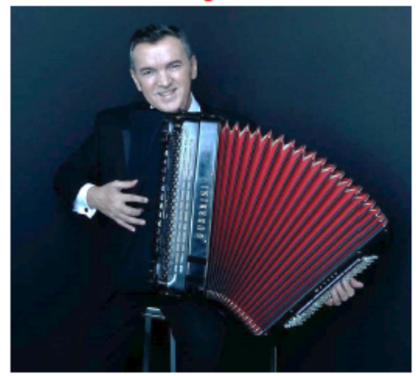
Music of ALBANIA