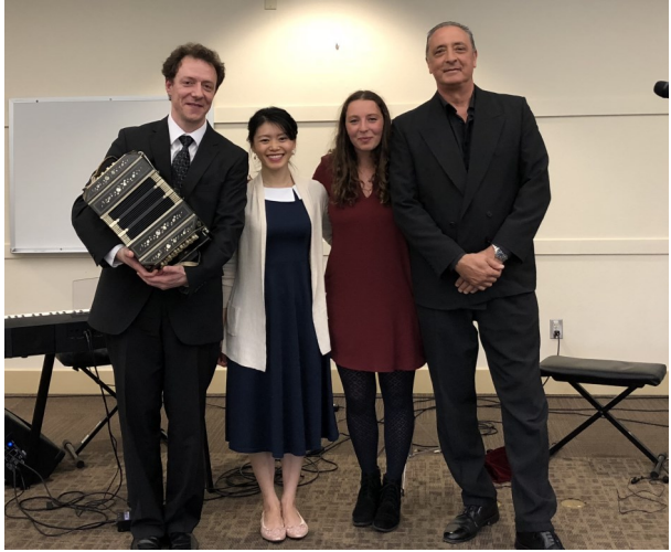
Continued on next page ...