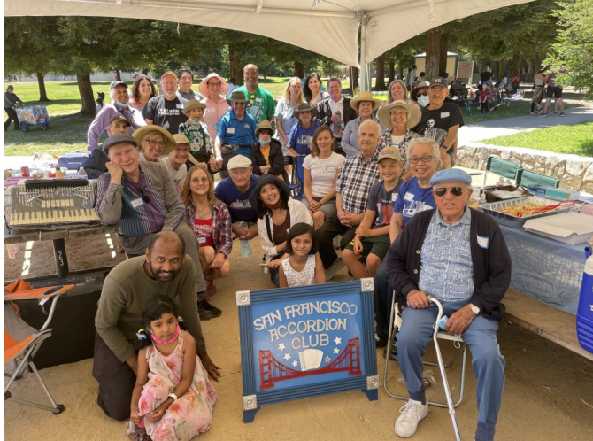
Above: SFAC 2021 picnic

May featured an outstanding Accordion Circle, and June continued with the SFAC featured prominently at the Festa Italiana in San Francisco. We were encouraged that so many of you of stepped up to volunteer to help, either in person or remotely, at the Accordion Circle. It takes dedicated Club members to make these events successful, so many thanks to all who volunteered. Let's keep the momentum going!