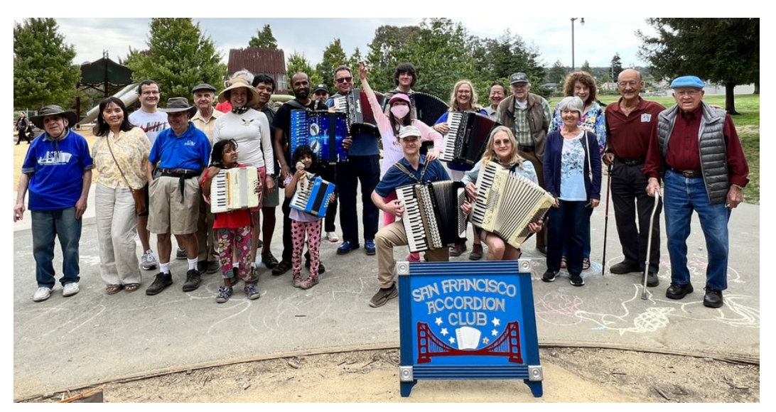
2022 SFAC Picnic—Photo courtesy of Linda Watson, daughter of Ed Massolo

The picnic area is adjacent to the: San Mateo Garden Center 605 Parkside Way