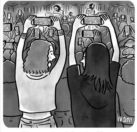
"I love recording shaky videos I'll never watch or show anybody."

More figurines will be available at the Cotati Accordion Festival, August 19 & 20.