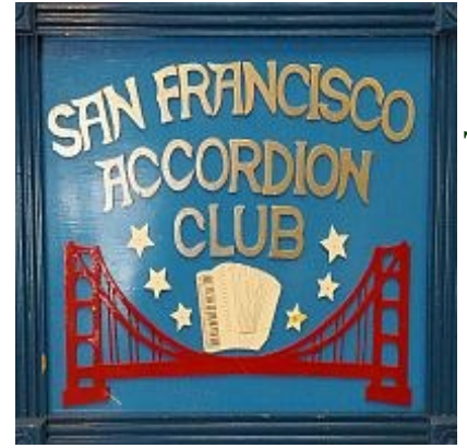
This gathering will be in lieu of our monthly program at the Chetcuti Center.

RSVP for details info@sfaccordionclub.com