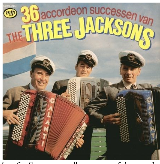
Just for Fun ...retro album cover of the month