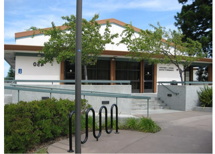
Millbrae Chetcuti Community Room Civic Center Plaza/Library Plaza 450 Poplar Avenue, Millbrae, CA SFAC Monthly Meetings: Plenty of free parking in Library lot

Accessible location Close to public transit