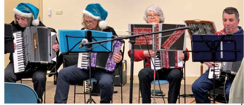
Continued on page 3