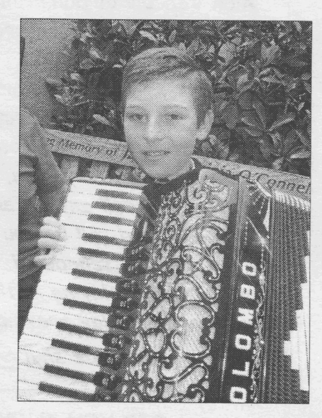
A Budding Dick Contino?