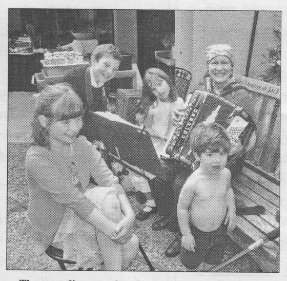
The accordion got a lot of attention from the kids at this September playing job . Turns out that the kids are all musical in one way or another (piano, guitar, ballet, etc.) and Dad even played accordion!