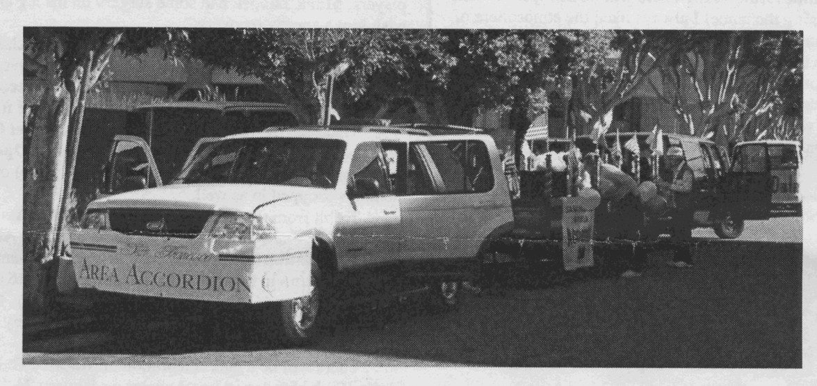
Hard at Work Decorating