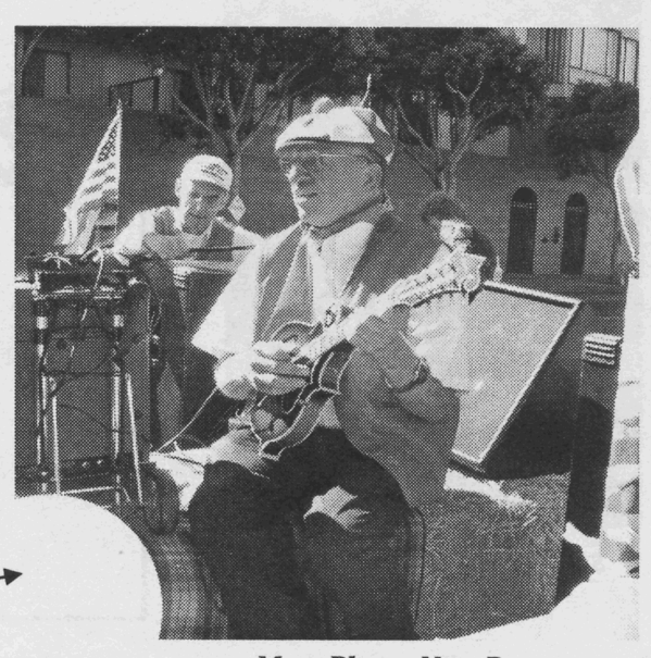
More Photos Next Page