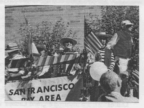
A Happy Crew