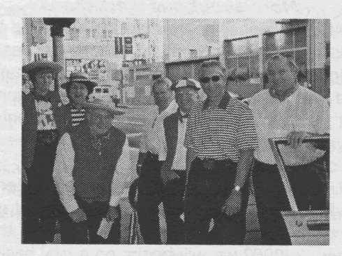
Gathering at Fifth & Mission

Free to BAAC members ($15 for non-members). Bring your accordion!