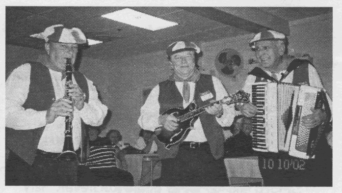
The Godfather Trio