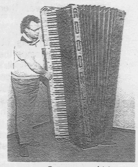
Can you top this?

BAAC Membership ... Dues are $25 per year, $30 for a family Send check to BAAC P.O. Box 318175 San Francisco, CA 94131-8175 Visit us at <u>www.BAACcordionclub.org</u>