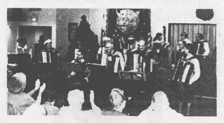
December Meeting: The SFAC "Fun Band"