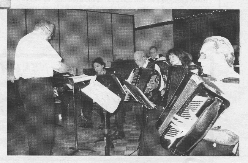
ACE Ensemble at Amici Club in mt. View 12-5-05

The SFAC thanks the Mariposa Argentine Tango Club for putting on a great show at our club picnic