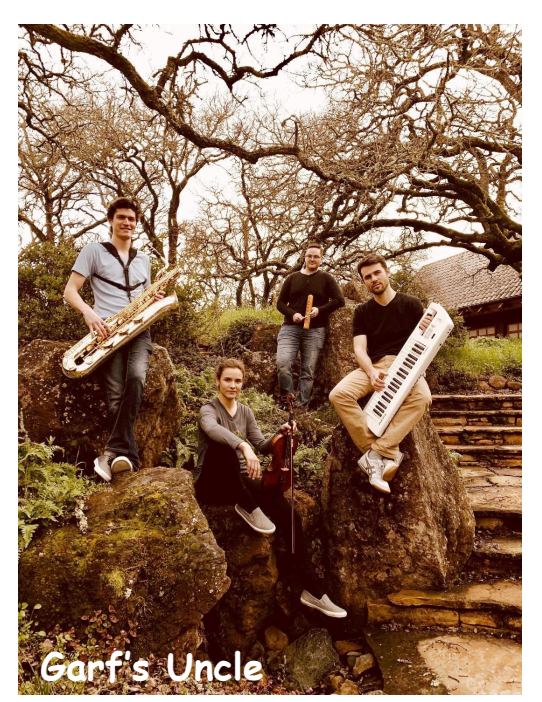
See page 3 for performers' information