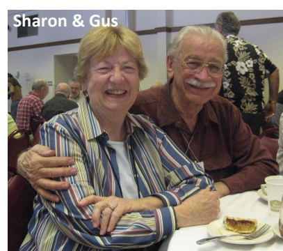
2007 Marocco-Ballarini Camp