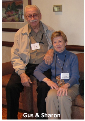
2012 Marocco event